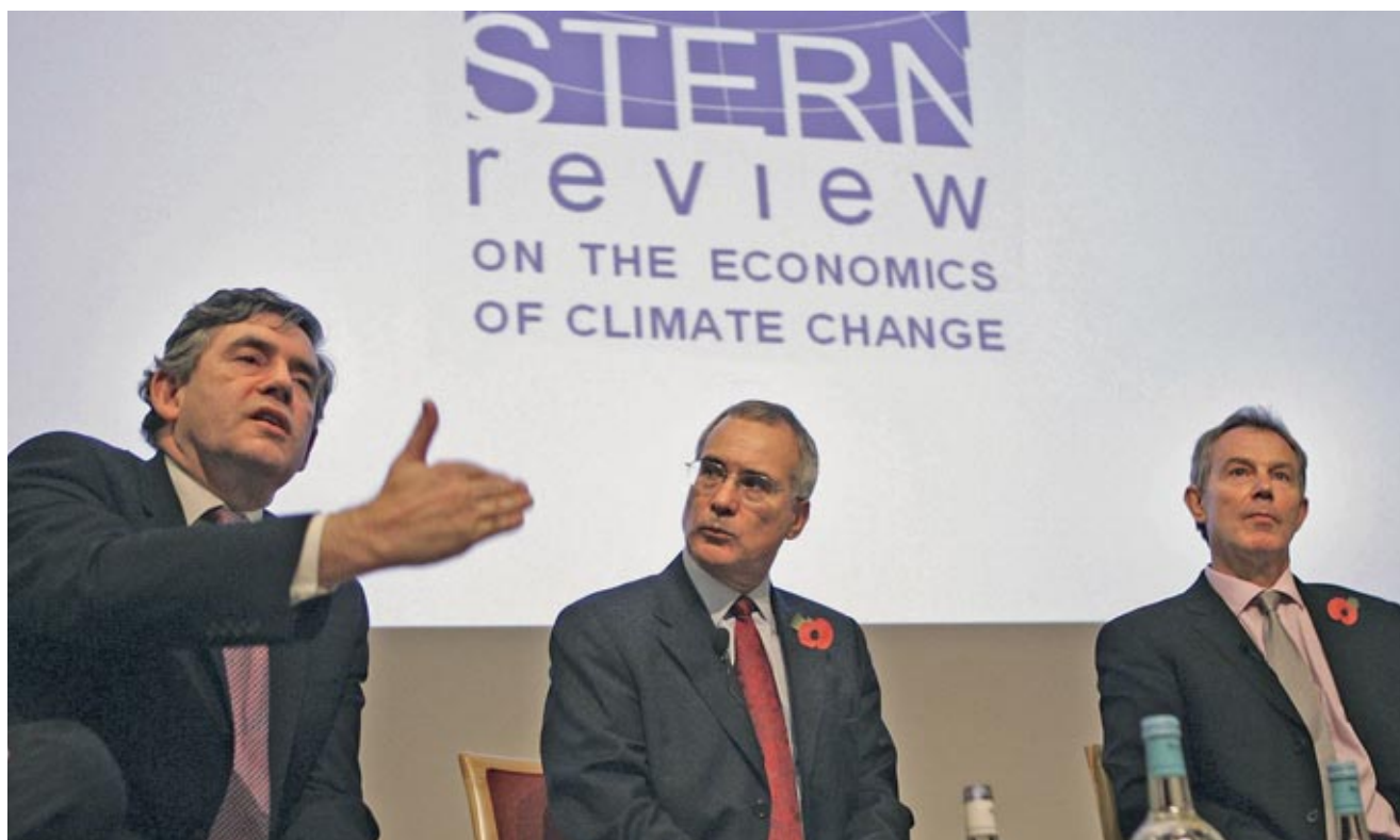
The Stern Review on the Economics of Climate Change was launched on 30 October 2006 in the presence of Chancellor Gordon Brown and Prime Minister Tony Blair. Nicholas Stern has continued to publish on the subject since then.

For many of us the two defining problems of our century are managing climate change and overcoming world poverty. If we fail on one, we will fail on the other. If we fail to manage climate change, there is a probability – we