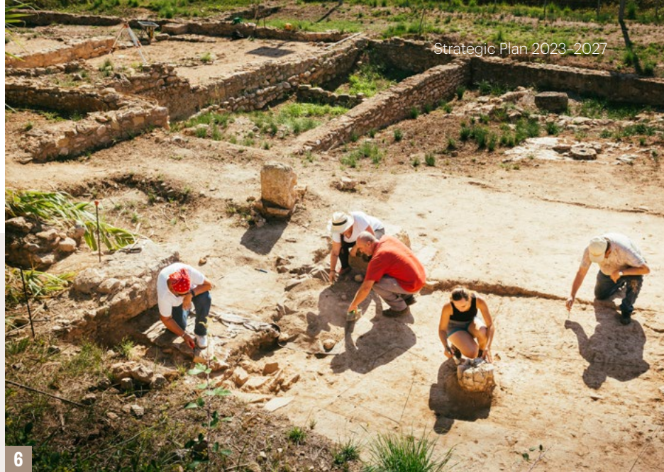
Strategic Plan 2023-2027