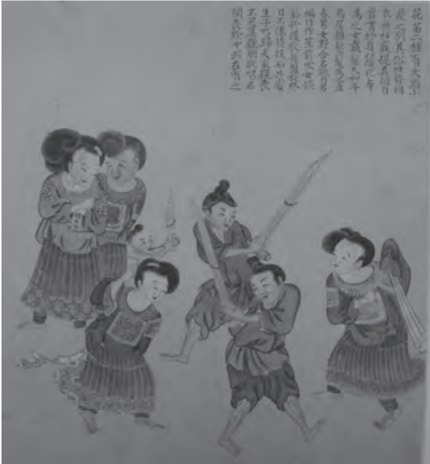
Figure 5. Miao Peoples. In Daily Life Illustrations of Miao and Yao Ethnic Groups 苗族生活圖, c. eighteenth century.

reflected contemporary worldwide racial preoccupations, focusing on physical traits including a close comparison of forehead, nose and eyes, and hair. 10 Although he wanted to return to China to conduct skeletal measurements—the core data for his study—he settled on 110 Chinese students and ‘Chinese laborers’ in the Boston area for his control group and conducted detailed biometrics. While this may have been the only pool available to him, he also appears to divide them according to class and intelligence. 11 This legacy of physical anthropology remained with