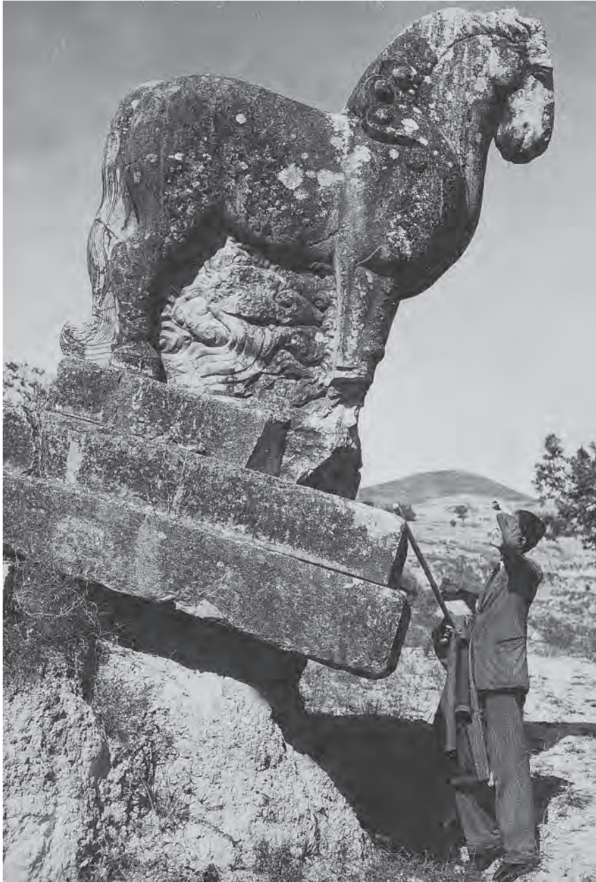
Figure 4. Wang Ziyun, sculpture of horse at Jianling 建陵, the necropolis for Suzong 唐肅宗 (711–62), in situ , Liquan 醴泉, outside of Xian, 1944. Suzong (Li Xiang 李享) was a son of the Tang Emperor Minghuang.