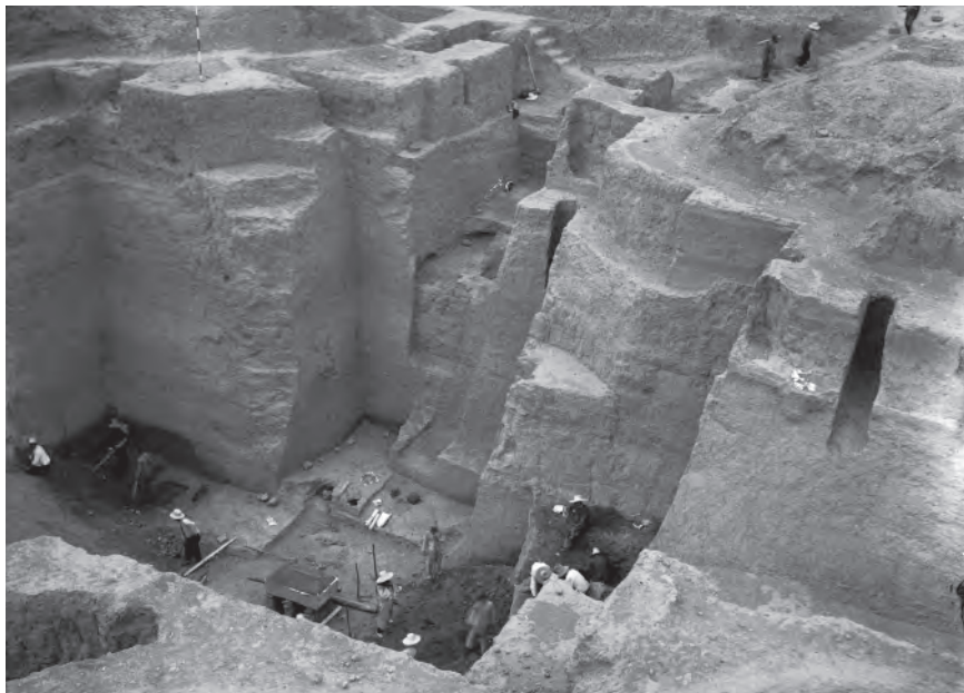
Figure 2. Xibeigang site, royal tomb 1001. 28 May 1935. Shi Zhangru, Head of the Yinxu Excavations for the IHP, photographer. © Institute of History and Philology, Academia Sinica, Republic of China.