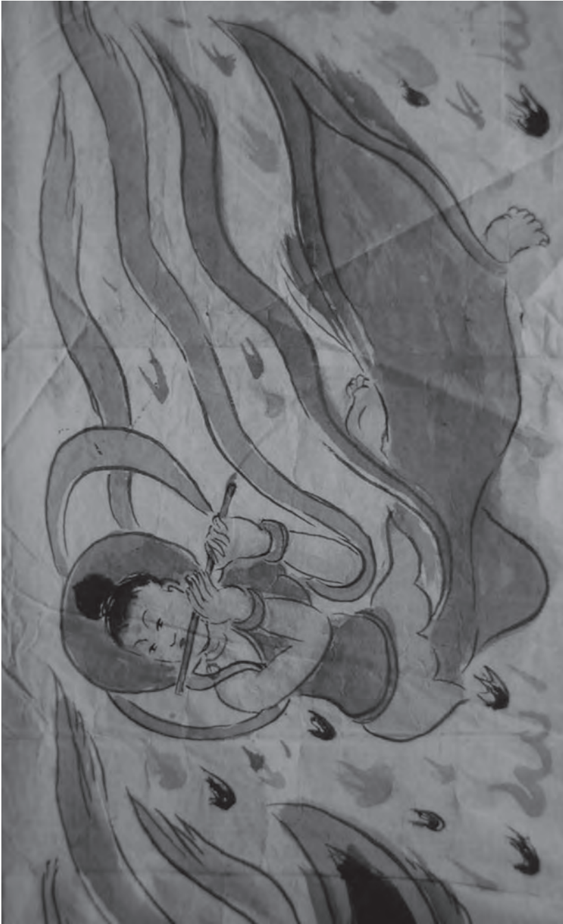
Figure 16. He Zhenghuang 何正璜 (1914–94) with Wang Ziyun, Copy of Apsara 飛天 in Tang Cave. Dunhuang, 1941–2.