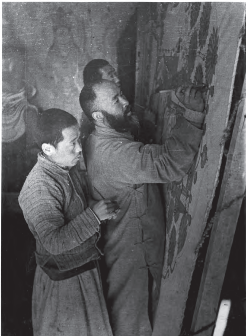
Figure 6. Zhang Daqian and two Qinghai painting assistants, Yulin Caves, May 1943.

high value was placed on fieldwork and verifiable evidence in all sectors of the humanities during the Republican period. In addition to Zhang's independent (personal) trip and Wang's Education Ministry expedition, the National Museum, the Geography Institute and the Academia