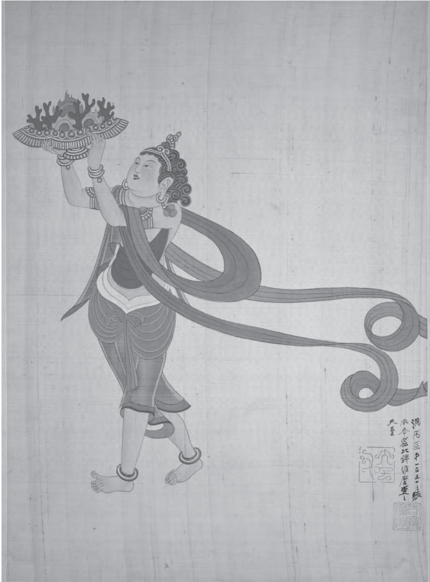
Figure 15. Zhang Daqian (1899–1983). Copy of Heavenly Attendant, Dunhuang cave 155 (DRA 9). 1942–3.