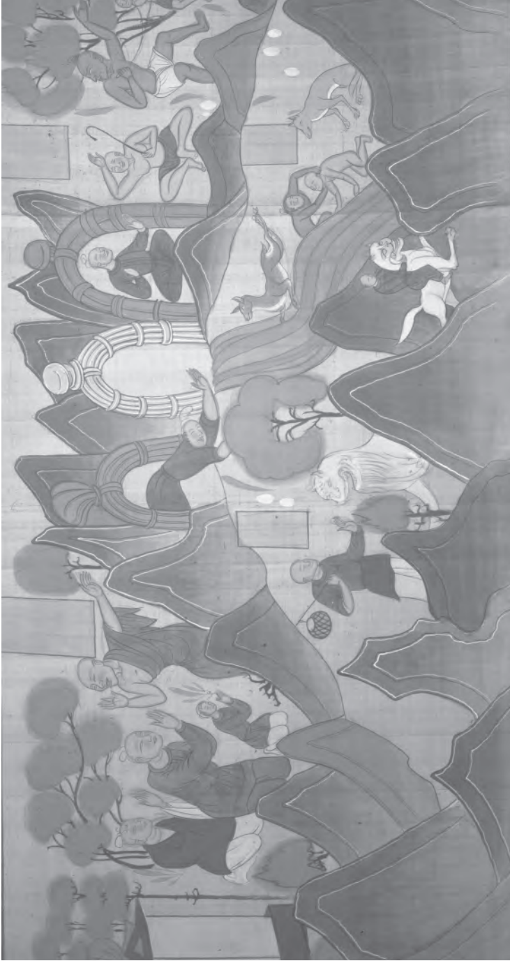
Figure 14. Zhang Daqian. Vessantara Jataka, 悉達太子施捨白象本生故事. Copy of east wall, Cave 428, Dunhuang, 1942-3.