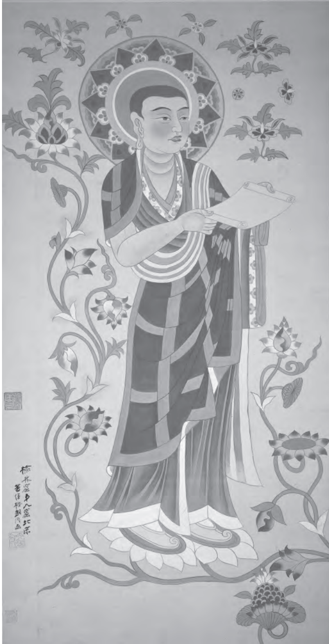
Figure 12. Zhang Daqian (1899–1983) and Shawo Tsering (Ch. Xiawu Cairang 夏吾才讓) (1922–2004). Copy of a bodhisattva (possibly Ananda) from Yulin cave 8 (DRA YL14), 1942.