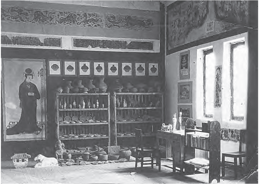
Figure 7. Wang Ziyun's research work room and exhibition space displaying samples, drawings and recreations of Neolithic pots, Han tomb figures, tomb relief rubbings, and tenth-century Dunhuang wall paintings, Northwest University, Xian, c.1944–5.