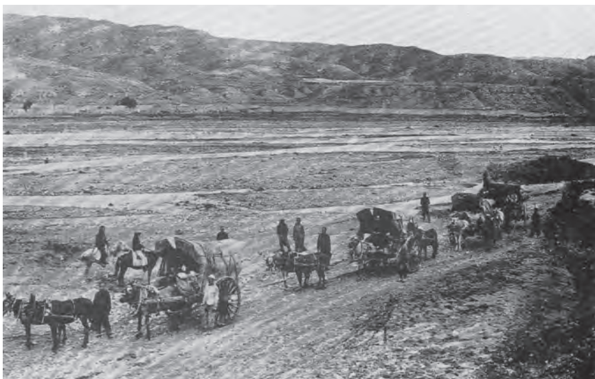
Figure 3. The Republican Government's Northwest History and Geography Research Group 西北史地考察團 on their way from Lanzhou to Dunhuang, c.1942–4.